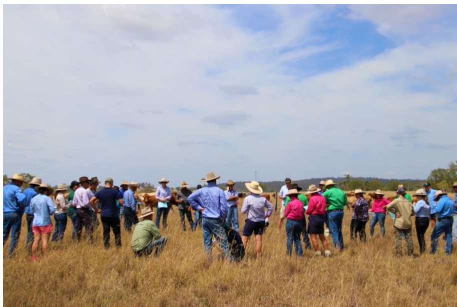
RCS Grazing Clinic participants March 2019

This RCS Grazing Clinic will be held in Biggenden between 9 – 11 October. To register, please call RCS on 1800 356 004 or email info@rcsaustralia.com.au .