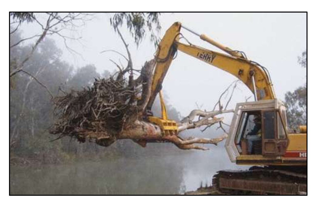
An excavator can be used for all phases of earthworks and reinstatement of LWD

Reinstate LWD at various angles to impede water flow – lay debris as most of the flood deposited LWD currently lays – at a slightly offset angle, which slows water flow. If available, place some logs into the water as basking and/or resting sites for fauna. LWD makes useful resource traps, provides habitat for wildlife and it slows and impedes overland flow of stormwater, further assisting infiltration rates. Refer to site-specific plans and fact sheet diagrams or photographs for placement of LWD along banks.