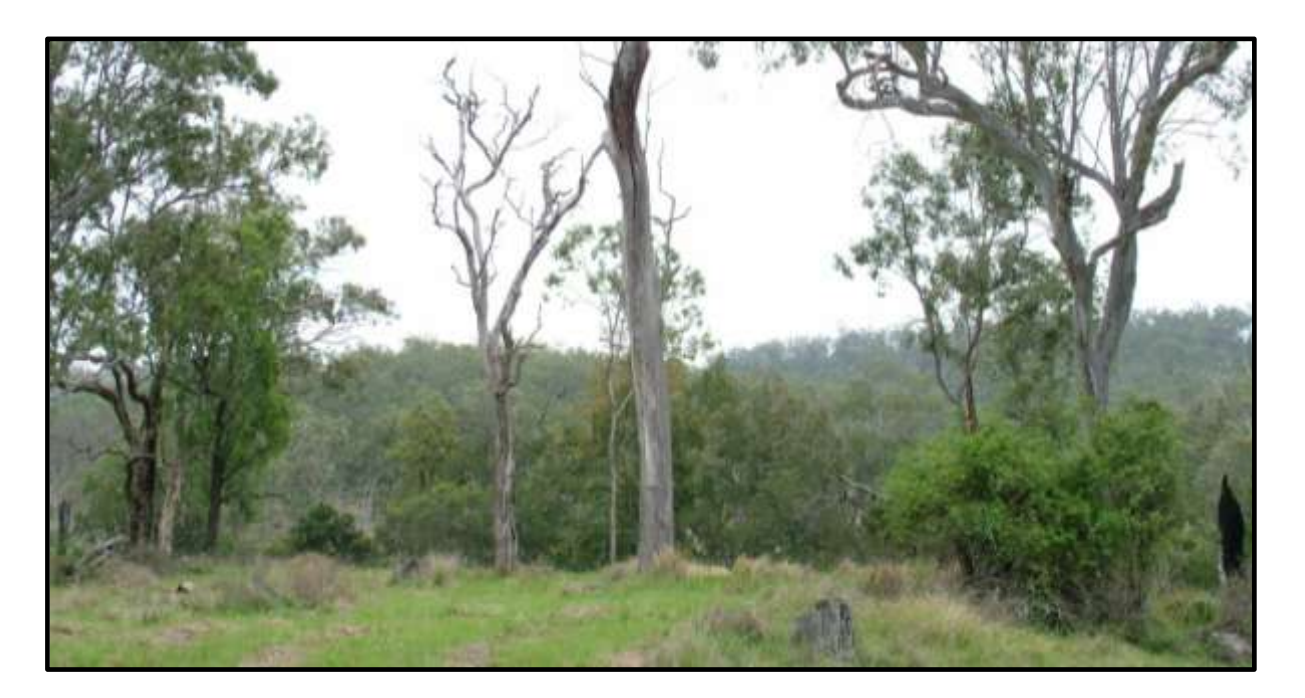
A well-grassed buffer of native species above intact riparian vegetation, grazed periodically for maintenance access and fire and management purposes. Dead hollow trees retained as habitat, with weeds kept under control and eradicated regularly

In most areas, it is not possible to re-establish buffer widths to the desired dimensions as historic land clearing and infrastructure development dominate land use from the top of the high bank, sometimes even extending below the high bank down into the riparian zone.