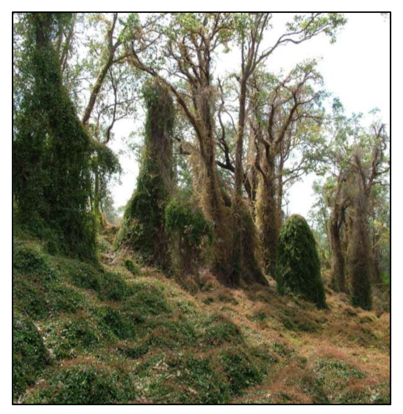
Do not allow pest species to go unchecked, as this Cat's Claw Creeper has been allowed in this riparian zone. Invasion by competitive species results in rapidly deteriorating water quality from lack of shade and the lack of filtering capacity in the groundlayer

Always seek specialist advice on the latest control methods and approved herbicides before initiating weed control activities. Call the Queensland Department of Agriculture Forestry and Fisheries or visit their site at <a href="http://www.daff.qld.gov.au/plants/weeds-pest-animals-ants">http://www.daff.qld.gov.au/plants/weeds-pest-animals-ants</a> for further information. Overwhelming infestations of Dolichandra unguis-cati (Cat's Claw Creeper) like that below are best treated manually to free the canopy and then through establishment of populations of biocontrol agents such as Hylaeogena jureceki (Leaf-mining Jewel Beetle). These take some years to establish and become truly effective, providing time to affect additional manual and chemical control from the outer perimeter inwards.