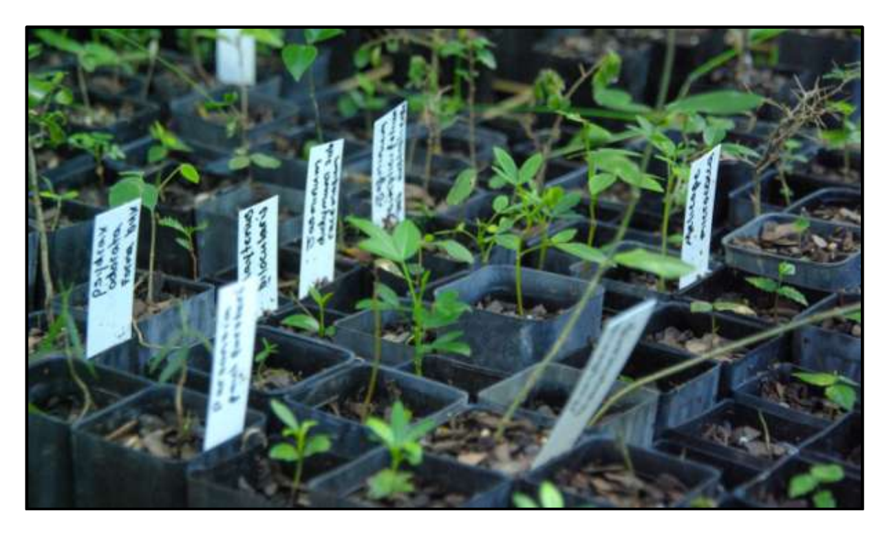
Use of local provenance seed is essential from which to produce tubestock for revegetation works

Depending on time of year, order plant stocks a minimum of 6 months ahead of the commencement of revegetation works – if the plan is to start work during the cooler months, there may be limited seed available. Refer to the appendices for a list of specialist suppliers and revegetation job supplies.