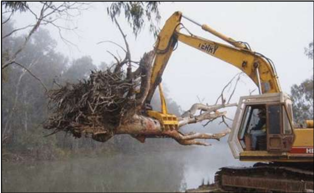
An excavator can be used for all phases of earthworks and reinstatement of LWD

Reinstate LWD at various angles to impede water flow – lay debris as most of the flood deposited LWD currently lays – at a slightly offset angle, which slows water flow. If available, place some logs into the water as basking and/or resting sites for fauna. LWD makes useful resource traps, provides habitat for wildlife and it slows and impedes overland flow of stormwater, further assisting infiltration rates. Refer to site-specific plans and fact sheet diagrams or photographs for placement of LWD along banks.