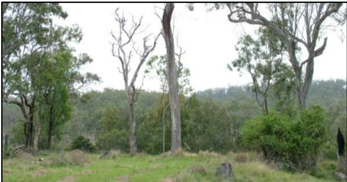
A well-grassed buffer of native species above intact riparian vegetation, grazed periodically for maintenance access and fire and management purposes. Dead hollow trees retained as habitat, with weeds kept under control and eradicated regularly

In most areas, it is not possible to re-establish buffer widths to the desired dimensions as historic land clearing and infrastructure development dominate land use from the top of the high bank, sometimes even extending below the high bank down into the riparian zone.